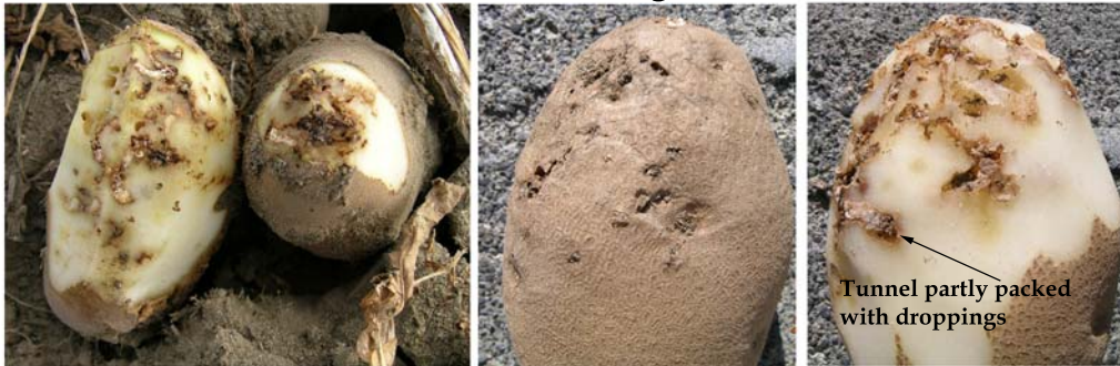
Tubers exposed at surface are most likely infested