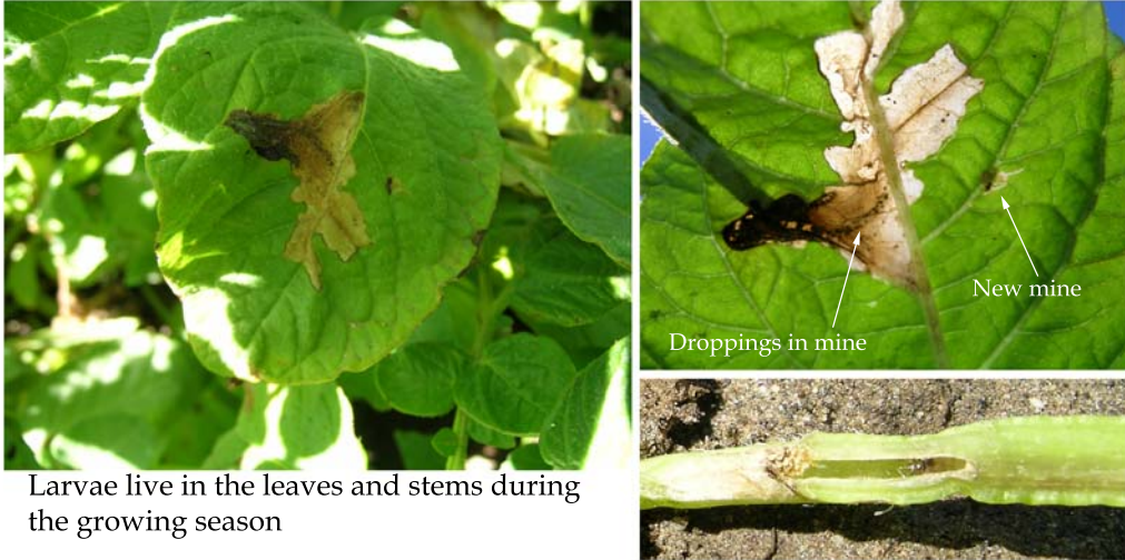
Larvae live in the leaves and stems during the growing season