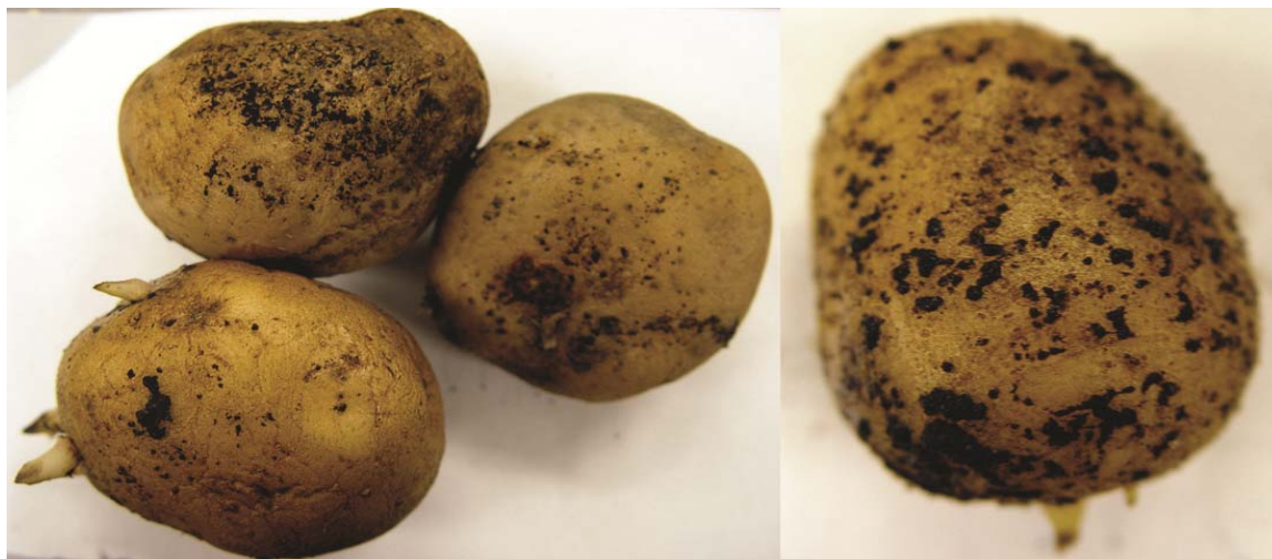
Figure 3. Black scurf on potato tubers caused by Rhizoctonia solani AG3.