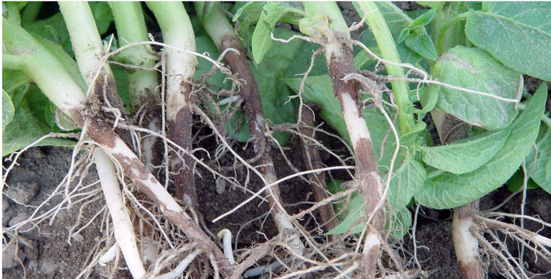
Figure 1. Stem canker on potato stems caused by Rhizoctonia solani AG3.