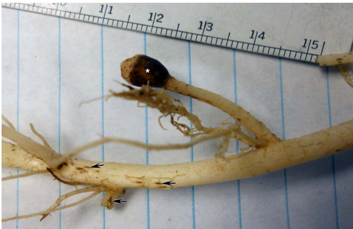
Figure 2. Stem canker lesions on a potato stem and stolons caused by R. solani AG2-2IIIB.