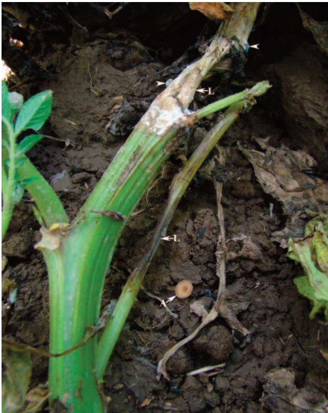
Figure 3. As infected tissue decays, hard resting structures called sclerotia (arrowheads) form inside and outside the decaying lesions (L). An apothecium (A) can be seen next to the infected stem.