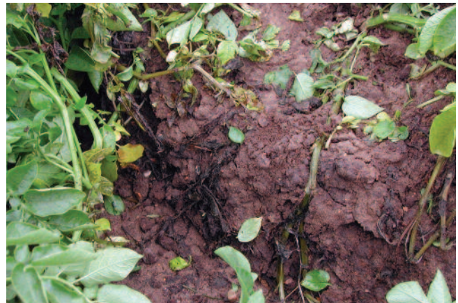
Figure 2. White mold lesions spread rapidly and can girdle stems, causing foliage to wilt. White mold is also often accompanied by bacterial stem rot, especially under wet conditions.

dies. The sclerotia can survive in the soil for several years.