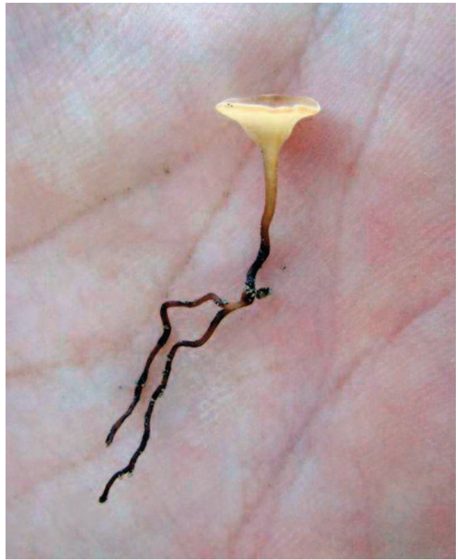
Figure 4. In late spring, sclerotia germinate to produce small, pink to beige, mushroom-like discs called apothecia.