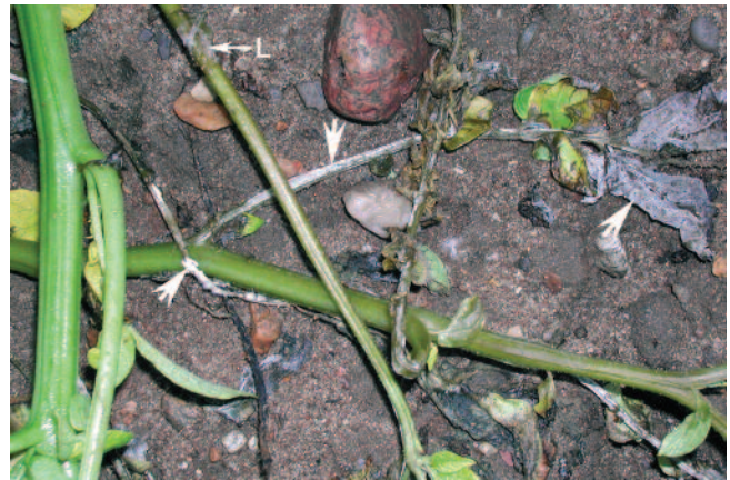
Figure 1. White mold lesions (L) usually first appear on branches and stems in contact with the soil. These areas become covered with a white cottony growth (arrows) and wilt.

As lesions expand, they girdle stems, causing foliage to wilt (figure 2). White mold is also often accompanied by bacterial stem rot, especially under wet conditions (figure 2). When conditions become dry, lesions dry out and turn beige, tan, or bleached white and become papery-looking. As infected tissue decays, hard, irregularly shaped resting structures called sclerotia form on the inside and outside of decaying tissue (figure 3). The sclerotia are usually 1/4 to 1/2 inch in diameter, start out white to cream-colored, and gradually turn black with age (figure 4). Stems are frequently hollowed out by the fungus, leaving a papery shell covering numerous sclerotia. The sclerotia are released from the papery shells and eventually fall to the ground as infected stems dry out and the host plant